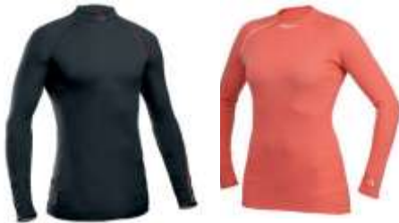
proZERO Extreme L/S $70.00

Put one on, and you won't want to take it off. The fabric is light, breathable, and extremely efficient. An internal air channel will allow body heat to dissipate through the fabric before it even has the chance to turn to sweat. Designed by a Nordic skier, any of these base-layers will work to regulate your body temperature whether you are ascending or descending, helping to keep your body at an optimal performance level. All pieces are also constructed using a circular knitting process, which results in a seamless, non-restrictive fit.