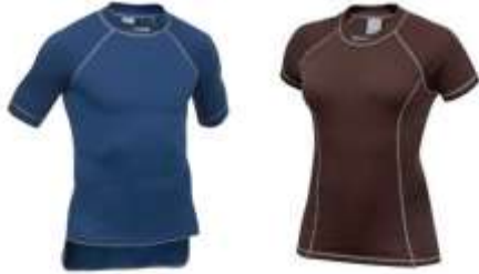
proZERO S/S $50.00