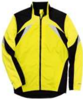
Nightlife Jacket $90.00