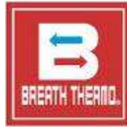
BT Running Crew $55.00