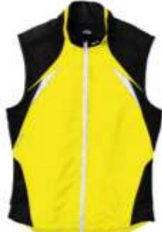
Nightlife Vest $80.00